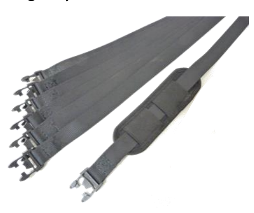
Set extra connecting straps